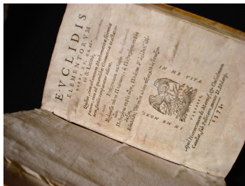
Euclid's Elements 1573 Edition