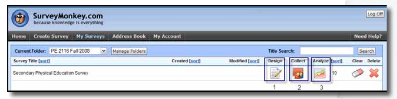
Figure 2 - Creating and Deploying a Survey

The Survey Monkey index page is very similar to other online survey websites. There is a place for visitors to sign into their account or to create a new account. On the index page are descriptions of the survey features of the website including tutorials, testimonials, pricing structures and information about the company behind the website. Perhaps the most important features of the index page are descriptions of the three steps in designing a survey. These descriptions demonstrate the intuitive process for creating and deploying a survey in only three steps (see Figure 2).