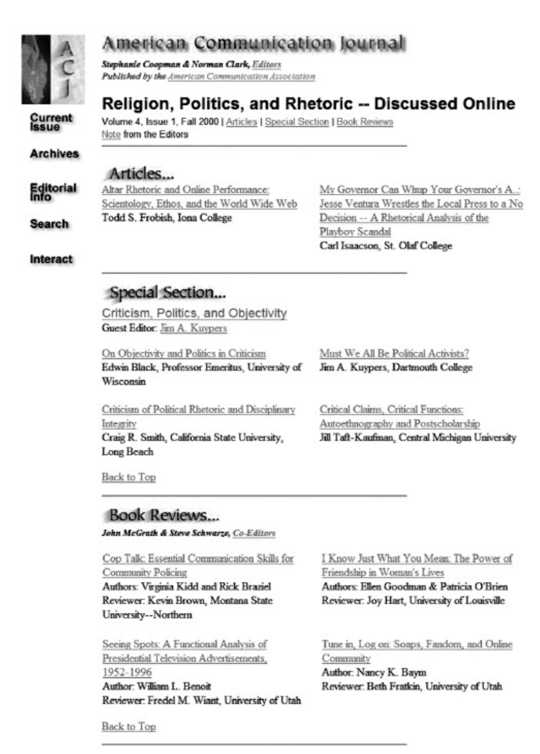
Home | Current Issue | Archives | Editorial Information | Search | Interact