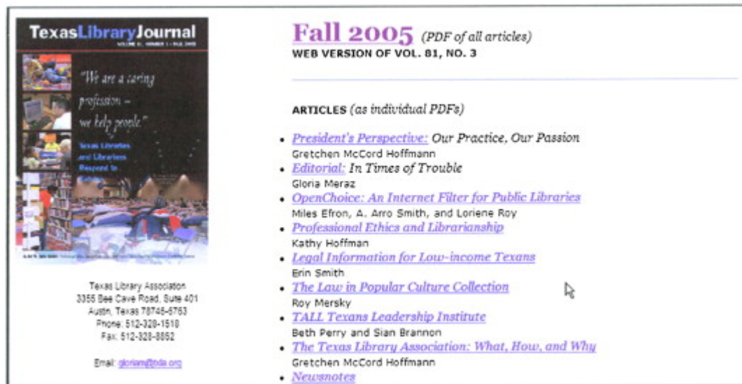
Figure 4. Texas Library Journal http://www.txla.org/pubs/tlj81/fall05.html .

But even with those membership concerns, she speculated that open access may not be far off: “Clearly, there is going to be a lot more electronic access whether we’re ready or not. Everyone else is ready for it. The call for current access to our publications online will continue to knock on our door as it has for a while.”