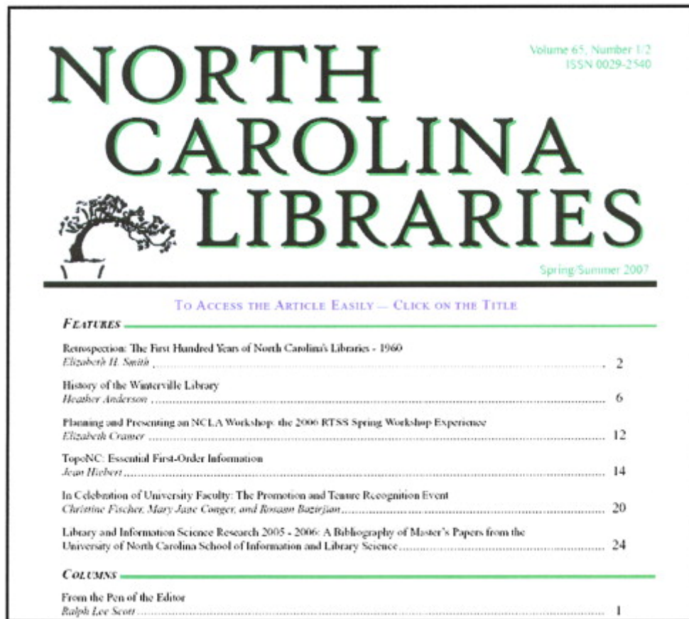
Figure 3. North Carolina Libraries http://0-www.nclaonline.org.wncln.wncln.org/NCL/ .