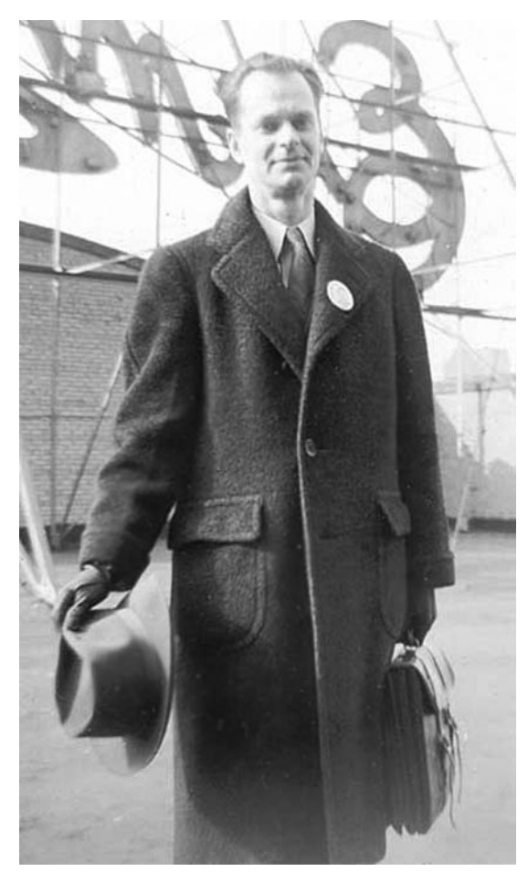
Fig. 2. B. F. Skinner standing on the roof of the General Mills Utility Building, just outside his wartime laboratory. The script of the "Eventually" sign (see Figure 1) is visible behind him.

contained a whole chapter (chapter 8) on "The differentiation of a response" in which Skinner had described the results of his experiments using the method of successive approximation to develop differentiated operant lever-pressing behavior in rats. In that work he had found that, when he gradually increased response force or duration requirements, the rat pressed more forcefully or held the lever down longer, respectively. Wasn't that shaping? Of course it was. But why, then, was he so amazed by what he saw in the bowling pigeon in 1943? One might understand his being impressed in 1933, 10 years earlier, when he was still in the process of discovering the basic principles of operant conditioning. But 1943?