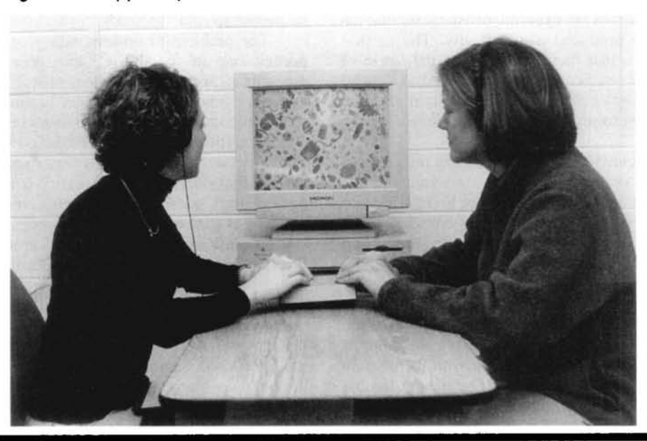
Figure 2 Experimental Setting for the I Spy Study

The experimenter explained that the study would investigate people's feelings of intention for acts and how these feelings come and go. It was explained that the pair were to stop moving the mouse every 30 seconds or so and that they would rate each stop they made for personal intentionality. That is, they each would rate how much they had intended to make each stop, independent of their partner's intentions. The participant and confederate made these ratings on scales, which they kept on clipboards in their laps. Each scale consisted of a 14-centimeter line with endpoints I allowed the stop to happen and I intended to make the stop, and marks on the line were converted to percentage intended (0-100).